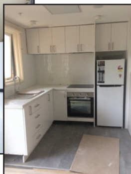
▼ Prototype Kitchen