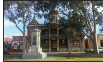
Town Hall ▲ War Memorial & Mechanics Institute