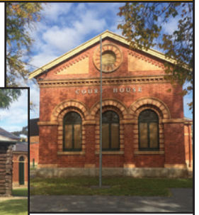
▲ Court House Museum ◀ Log Lock-up ▼ Presbyterian Church