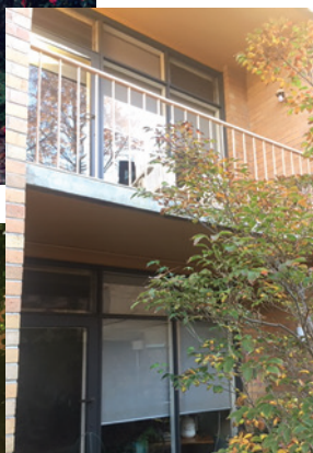
◀ Building 12 before painting ▲ Building 12 after painting