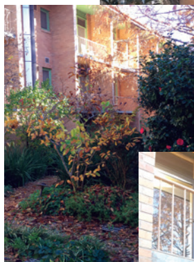
Autumn garden ▶