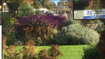
◀ Canterbury Gardens