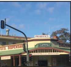
Eaglehawk State School ▶

It all began in 1852 when one Joseph Crook found a gold nugget while searching for stray horses and started the Eaglehawk goldrush. Local myth has it that Crook noticed an eaglehawk flying near his claim and named it accordingly. The newly established Eaglehawk township quickly grew to 40,000 inhabitants and became the Borough of Eaglehawk in 1862. By 1893 the alluvial gold was exhausted, reef mines were established with 300 tonnes of gold extracted but most of these too had closed by the end of the 1890's. Grand buildings and homes remain from the era and the post gold rush period when industry moved away from mining.