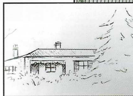
◀ Sketch of Gatehouse ▲ Current gatehouse

walking track is very popular with locals.