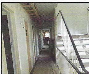
Building 14 renovations ▼▶