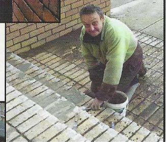
Dean at work on front steps At work on privacy screen ▼