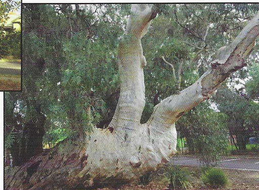
▼ Heritage gum tree