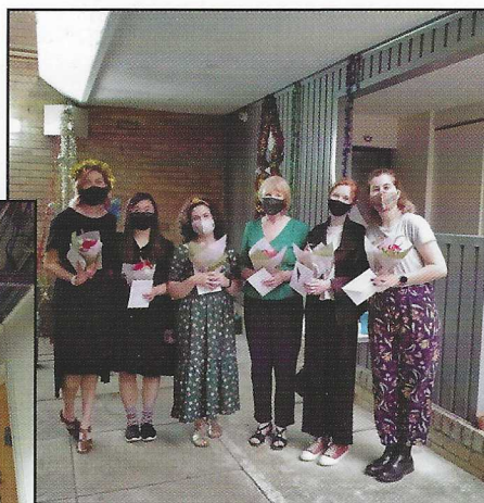
▲ Christmas Carols Choir in the courtyard