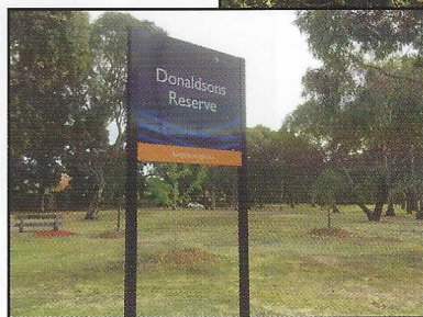
Moreton Bay Fig ▶ Donaldsons Reserve ▼

Besides the street name, the site of the creek which ran through the Belle Vue property, now an underground drain, is known as Donaldson's Reserve. The narrow strip of parkland and its