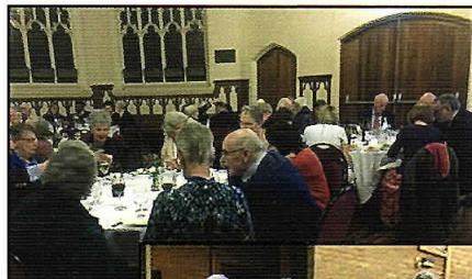
Conference Dinner ▲