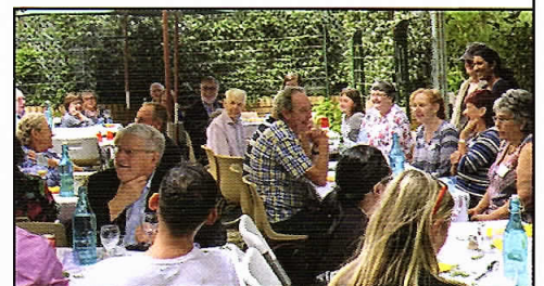
▲ Volunteers' Lunch