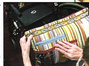
Fiddle Cushion ▲