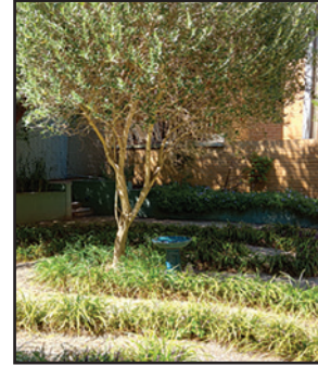
▲ Labyrinth after the 1st garden working bee